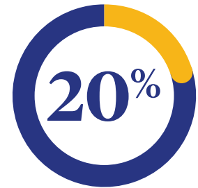
average retail gym membership savings with One Pass Select 3

Half of U.S. consumers report wellness as a top priority in their daily lives. 1 One Pass Select™ is designed to help make it easier for your employees to prioritize their health and wellness through a lower-cost, extensive nationwide gym network—including digital fitness. Best of all, your employees have the freedom to choose the option that fits their needs and lifestyle.